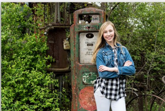
An outdoorsy grungy location

Once you're happy with your look, we'll begin in our 1500-square foot indoor studio. Then we'll head out to our 7- acre outdoor studio. We can also go to the beach and other locations. And you can use as many outfits as you like!