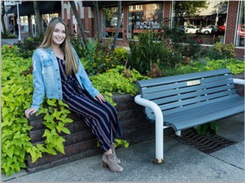
Downtown St. Joseph

BEFORE we begin shooting your senior photos, you'll probably want to get your hair and / or makeup done. Guys should visit their barber a few days in advance. Girls should arrive with their hair session-ready, but may want to use our makeup artist who specializes in makeup for photography.