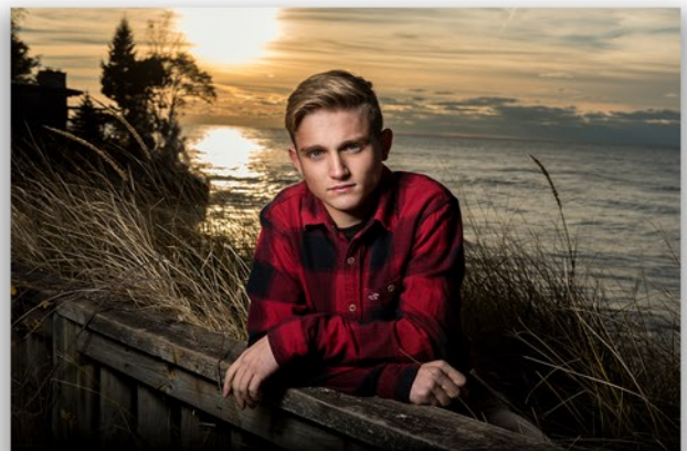
Lincoln Township Beach at sunset